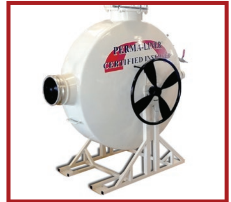
PERMA-LATERAL™ 44" INVERSION UNIT