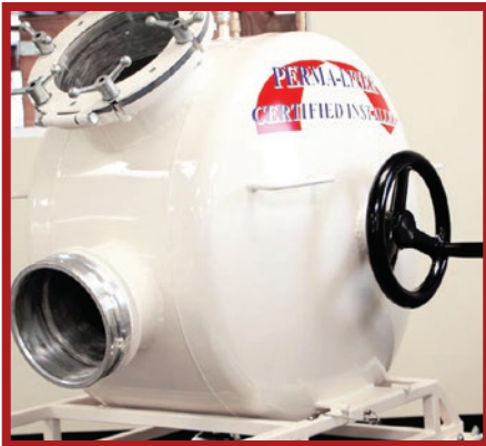
PERMA-LATERAL™ PIVOTING INVERTER