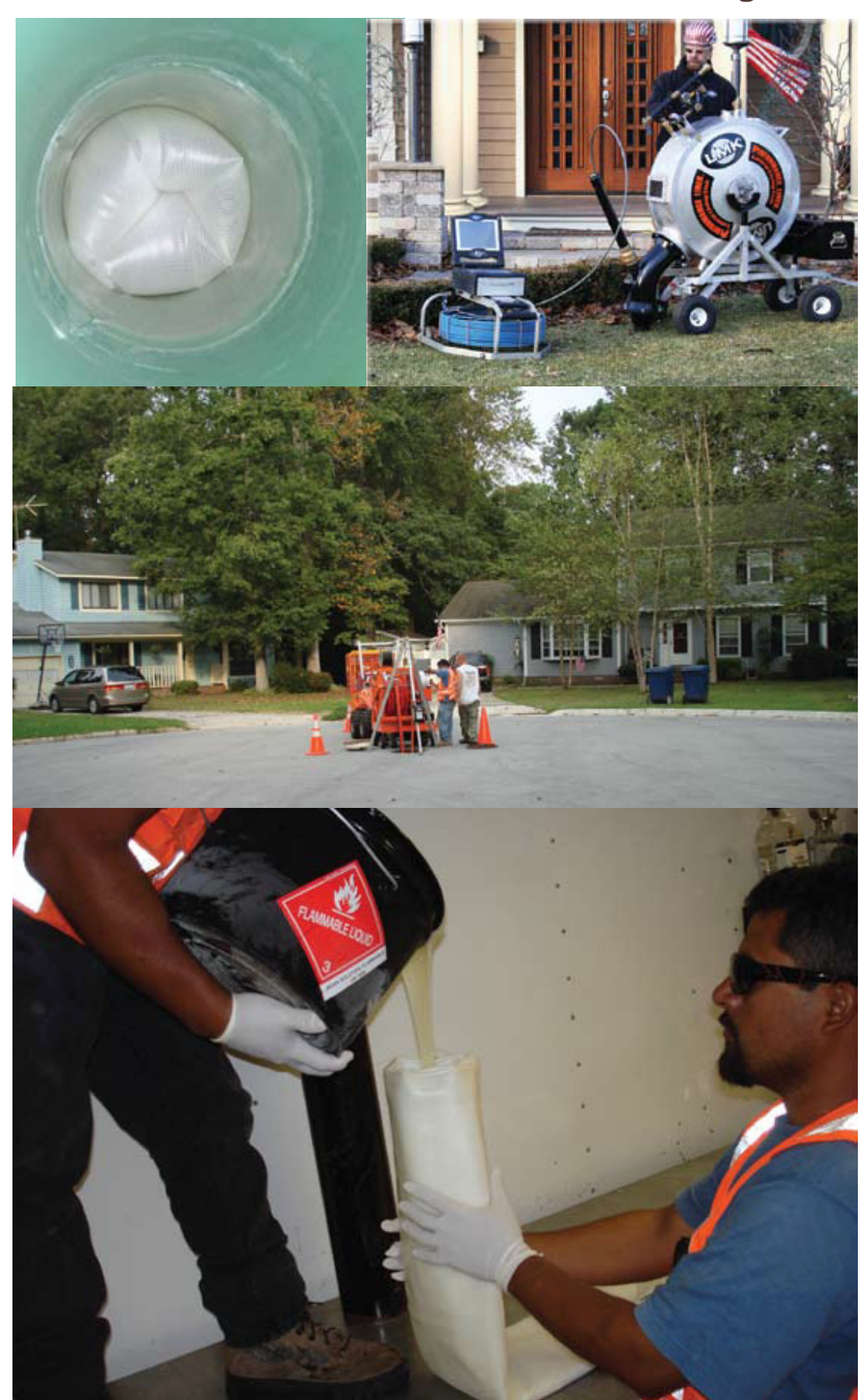
Clockwise from top left: Best bladder removed; Clint launcher; The Reel in Suburbia; Impregnating Liner in Trailer View

The finished product is a structural one piece joint less, seamless new lateral pipe connected to the main pipe. By utilizing this technology, home-owners experienced very little disruption, no extensive landscaping or street restoration was necessary and the city achieved the reduction in flow as designed and anticipated.