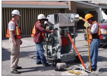
Insade of Mexico, an LMK licensed installer, recently completed a lateral renewal project in Guadalajara that included the renewal of 500 laterals using the T-Liner process.

This lateral market has not been an easy undertaking by any means. Specialized installation equipment was being developed and the need for specialized lining tubes and resins were a major hurdle. The demand for lateral lining while providing a non-leaking connection started in Nashville, Tenn., in the early 1990s. Nashville Metro was quick to recognize that rehabilitation of mainlines was not the end of its I/I issues. Lateral renewal soon became a standard item in Nashville's contracts. These contracts called for a sealed system and verification through air testing. This was a difficult challenge to the industry and hence was the creation of the innovative one-piece main and lateral CIPP.