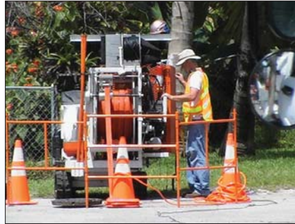
The Miami-Dade Water and Sewer Department of Miami-Dade County, Fla., is in full lateral lining production.

"We researched and trialed a number of lateral lining products," Shelton says. To provide the longest possible