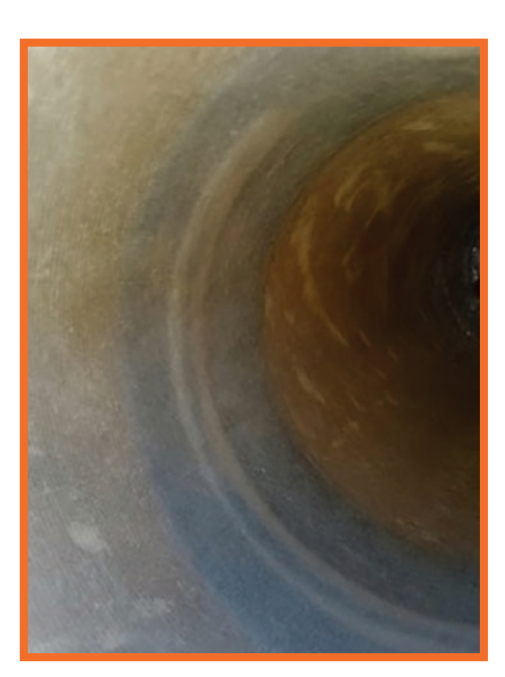
LEFT: CIPP liner with Insignia End Seal Gasket sealing technology.

ASTM F2340 is the Standard Practice for Installation of Seamless Molded Hydrophilic Gaskets (SMHG) for Long-Term Water Tightness of Cured-in-Place Rehabilitation of Main and Lateral Pipelines. This practice covers the requirements for the installation of SMHG in CIPP rehabilitation of main and lateral pipelines. When exposed to water, engineered and molded Insignia™ hydrophilic neoprene gaskets swell to create a positive compression seal that prevents water tracking between the liner and host pipe. The cylindrical shape of Insignia gaskets generates uniform compression to form a highly effective seal with all types of piping.