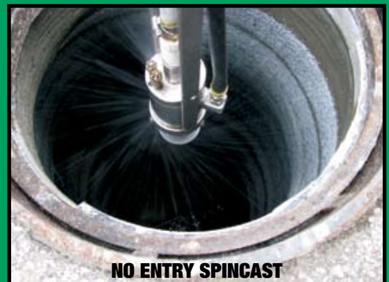
NO ENTRY SPINCAST

Heated plural-component pump for precision mixing and easy clean up.